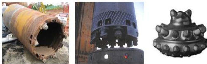
Figure 5: Schematic principle of “rock crushing” (left) and critical drill bit or button pressure (right)

Air roller core barrels are used to cut an annulus into the rock mass by applying thrust V and rotational torque M . The number of rollers has to be matched with the barrel diameter and the rotational speed of the drilling operation. After cutting the annulus, the rock core has to be removed by either breaking it with the barrel or by the use of chisel, rock augers or DTH hammers. The time for breaking the core has to be considered in determining the productivity of the process and depending on rock characteristics it could take longer to break and to remove the core than drilling the annulus. Different ground conditions require different drill parameters for this particular technique.