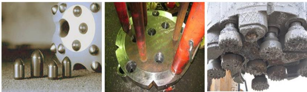
Figure 7: typical drill bits and button inserts (left) for DTH hammers, assembly of individual DTH hammers and base plate of cluster barrel (centre), individual drill bits of a cluster barrel (right).