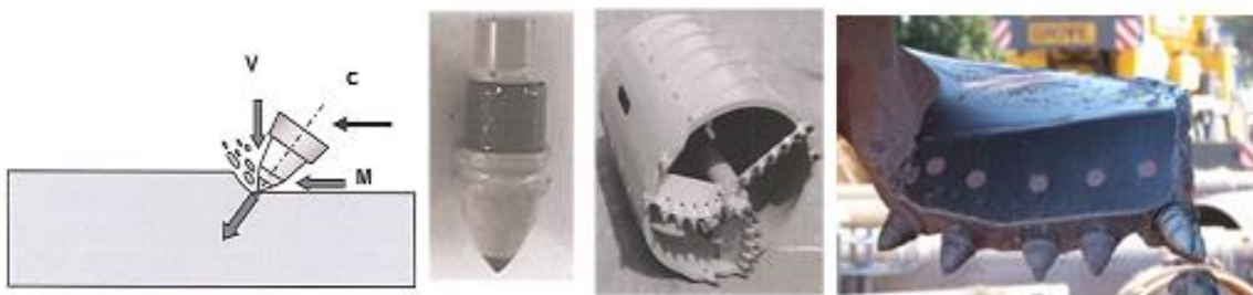
Figure 2: Working principle of a bullet tooth / drag pick (left), typical bullet tooth with tungsten carbide tip (centre left), typical core barrel with cross cutter (centre right), auger starter with bullet teeth (right)

If the applied thrust (V) and rotary torque (M) are insufficient, the bullet teeth won't be able to bite and break the rock into cuttings or chips; instead it will produce fine grinding particles, resulting in low penetration rates and high bit wear.