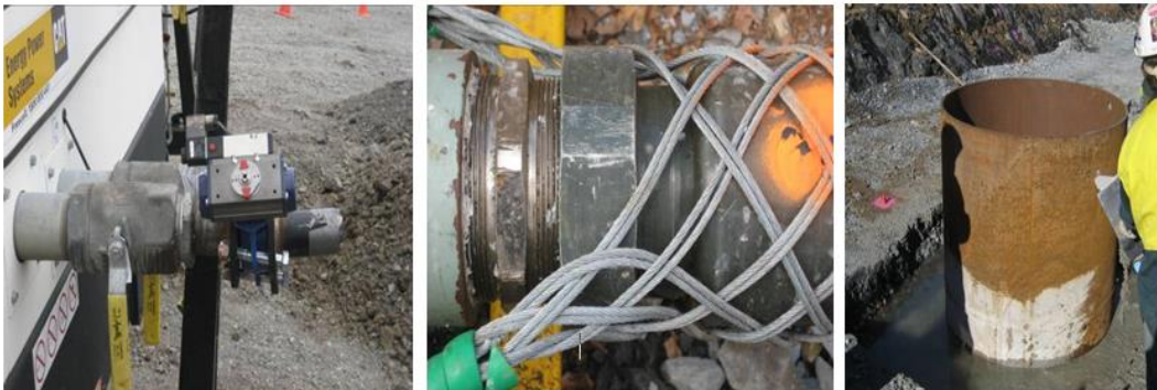
Figure 8: Automatic switch-off at compressor (left), typical whip check connection for high pressure air hoses (centre), casings should be installed as fall protection even if rock is close to surface (right)

Cluster drilling requires the use of high pressure equipment. Economical production rates of cluster drills or DTH hammer operations can only be achieved by high air pressure which controls the energy input into the rock by the drill bit and button. In the author’s opinion, it is crucial for any cluster drill or DTH operation to ensure that all air compressors are fitted with automatic switch-off devices and all high pressure hoses are connected and secured with additional whip check connections (Figure 8).